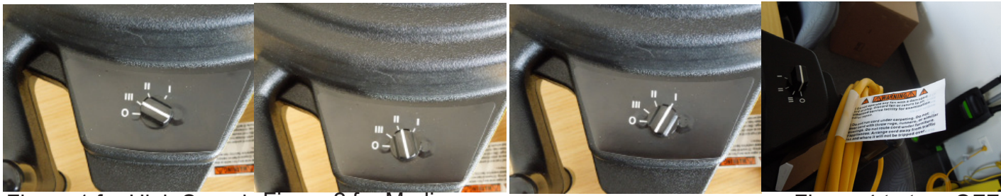
Figure 1 for High Speed Figure 2 for Medium Speed

The Speed selector switch provides the following settings, III = High Speed, Figure 1; II = Medium Speed, Figure 2; I = Lo, Figure 3; and 0 = Off, Figure 4.