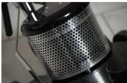
High-quality components and steel housings better absorb vibration for smoother operation.