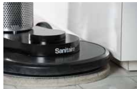
Non-marking bumpers ensure damage-free hard surface cleaning.

TACKLE BIG CLEANING JOBS. Our single-motor, 17-Inch Floor Machine with steel housing takes on tough jobs but makes them easy on you. This machine delivers aggressive scrubbing, stripping, buffing and polishing power as well as intuitive operation and less vibration.