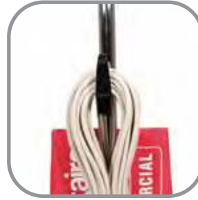
50-ft. Power Cord