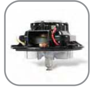
1000 Hour Motor